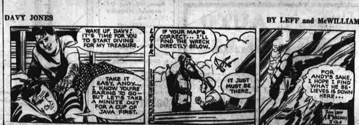
BY LEFF and McWILLIAMS